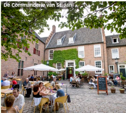
De Commanderie van St. Jan

Continue straight ahead past the park. At the end, on the left, you will see the 'Commanderie van St. Jan' > see 16 .