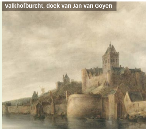
Valkhofburcht, doek van Jan van Goyen

Cross the park towards the ruin > see 23 .