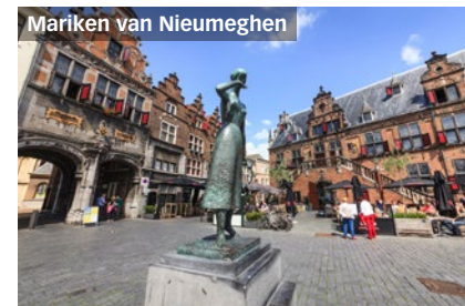
Mariken van Nieuwmeegen

In the middle of the Grote Markt you will see Mariken, separated from Moenen and contemplating her sins. The little alleyway further along, in amongst the bars and cafés, is called Vijfringengas. This refers to the rings which Mariken had to wear round her neck as a punishment. Only when she had been forgiven did they fall off. The five rings can be seen on the post which bars the alley.