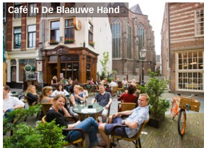
Café In De Blaauwe Hand

We continue in the direction of the Café 'In De Blaauwe Hand'. This is the oldest café of Nijmegen. The name is connected with the Laeckenhal (Cloth Hall). The indigo pigment which the cloth dyers used, was particularly difficult to wash off their hands. They would go to the café after a hard day's work, their hands still stained blue, and so giving it its name "In the Blue Hand".